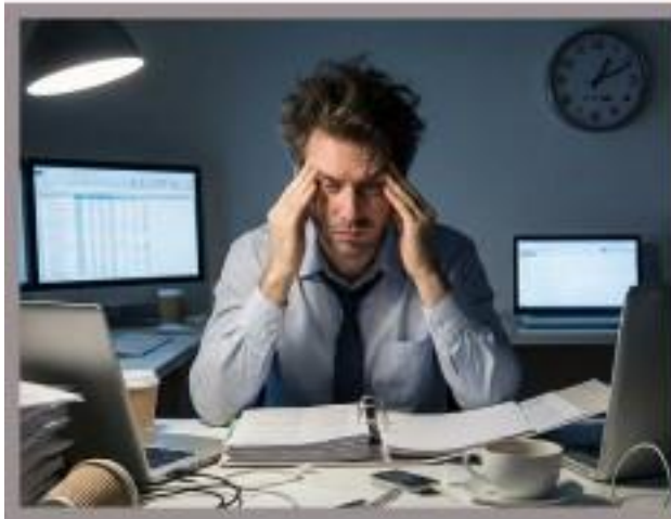
Without Neuro ENERGIZER